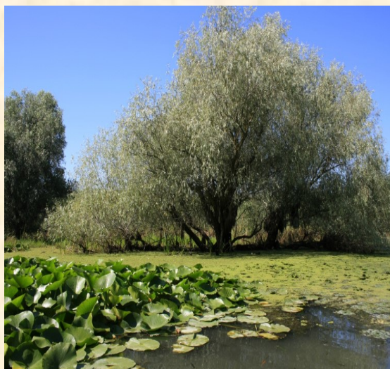
The Danube Delta

The River Danube, which is Europe's second longest river after the Volga, rises in Germany and flows southeastwards for a distance of 2,857 km course through ten countries before emptying in Romania's Danube Delta, the second largest and best preserved delta in Europe, and also a biosphere reserve and a biodiversity World Heritage Site. Some of the Danube 1,075 km length bordering the country drains the whole of it.