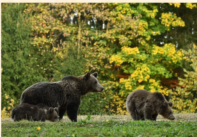
Romanian brown bear

The River Danube, which is Europe's second longest river after the Volga, rises in Germany and flows southeastwards for a distance of 2,857 km course through ten countries before emptying in Romania's Danube Delta, the second largest and best preserved delta in Europe, and also a biosphere reserve and a biodiversity World Heritage Site. Some of the Danube 1,075 km length bordering the country drains the whole of it.