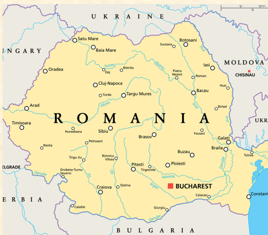
Topographic map of Romania

The Carpathian Mountains dominate the centre of Romania, with 14 mountain ranges reaching above 2,000 m or 6,600 ft, and the highest point at Moldoveanu Peak (2,544 m or 8,346 ft). They are surrounded by the Moldavian and Transylvanian plateaus and Carpathian Basin and Wal-lachian plains.