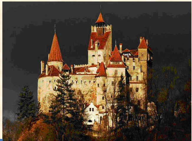
Bran Castle near Brasov, sometimes advertised as "Dracula's Castle"

Romania is popular for its summer and winter attractions such as: Black Sea Resorts, skiing resorts along the Valea Prahovei, Poiana Brasov, Castles in Transylvanian cities such as Sibiu, Brasov, and Sighisoara. Rural tourism, focusing on folklore and traditions, has become an important alternative, and is targeted to promote such sites as Bran and its Dracula's Castle, the Painted churches of Northern Moldavia, and the Wooden churches of Maramures. Other attractions include Danube Delta and Sculptural Ensemble of Constantin Brâncusi at Târgu Jiu.