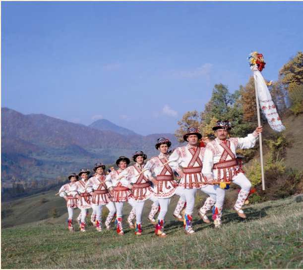
Folkloric dance group wearing Romanian traditional costumes from Oltenia region

There are 16 non-working public holidays, including the Great Union Day, celebrated on 1 December in commemoration of the 1918 union of Transylvania with Romania. Winter holidays include the Christmas festivities and the New Year during which, various unique folklore dances and games are common: pluguşorul , sorcova , ursul , and capra .