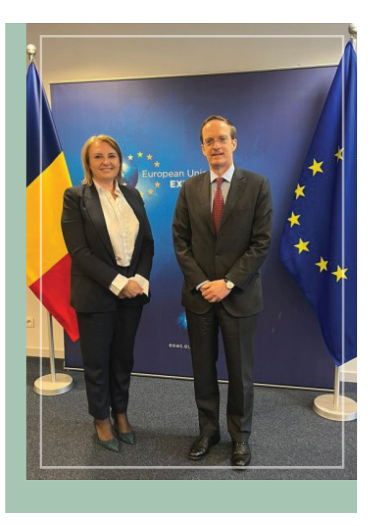
State Secretary's visit to the European External Action Service