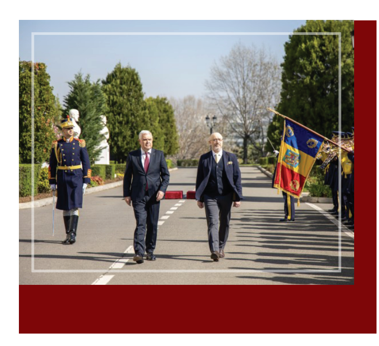
Defence Minister's meeting with his Ukrainian counterpart

"Ukraine's and the Ukrainian people's will in this second year of war is remarkable; we are and we'll always stand by this