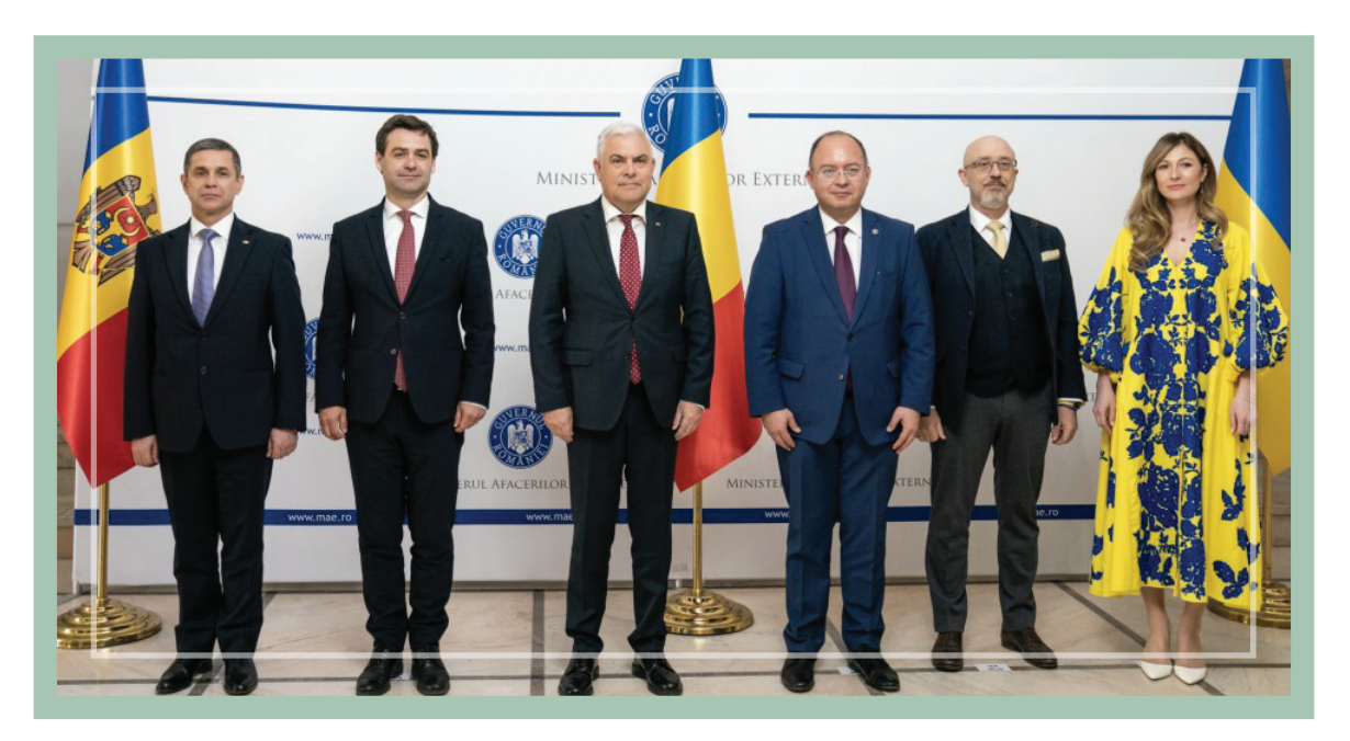
Participation of the Minister of National Defence in the Trilateral Romania – Ukraine – The Republic of Moldova on security issues

At the end of the trilateral meeting in the foreign and defence ministers' format, a Joint Declaration was signed by the six representatives of Romania, Ukraine and the Republic of Moldova, which emphasizes the main elements of the meeting agenda and the commitment of the three states to the development of trilateral cooperation.