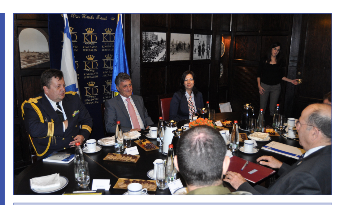
Photo coverage of the official talks with the Defence Minister of the State of Israel

The bilateral meeting of the Minister of National Defence, Mircea Duşa, and his counterpart, Mr. Moshe Ya'alon, the Defence Minister of the State of Israel took place on Tuesday, 24 June, in the context of the Romanian-Israeli Reunion at intergovernmental level, organized in Jerusalem over 23 and 24 June.