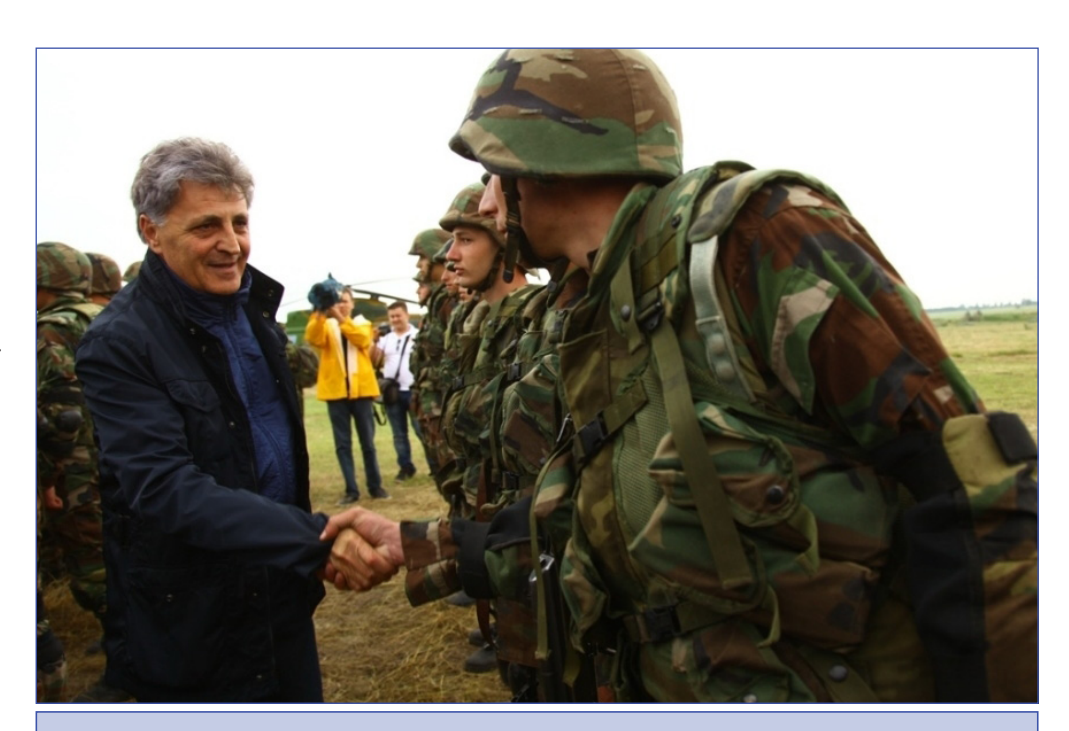
Minister of National Defence, Mircea Duşa, witnessed the development of the exercise

The troops were deployed for the exercise come from Focşani, Brăila, Galați and Bacău garrisons. Exercise "Mălina 14" was attended by a platoon from the Republic of Moldova as well.